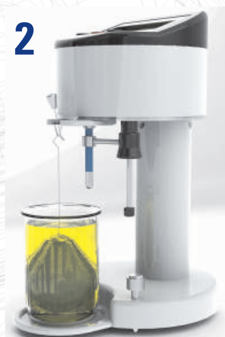
2 Weighing float in liquid...