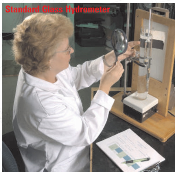
Standard Glass Hydrometer