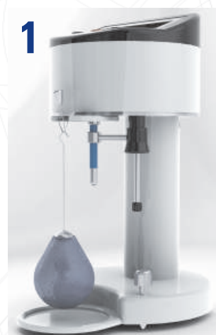
1 Weighing float on air...